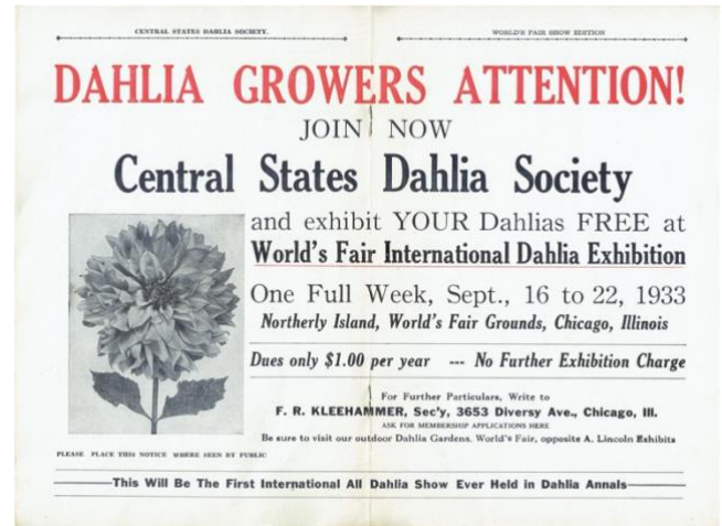
Ad from World's Fair Show Edition brochure

In both 1933 and 1934, CSDS sponsored a large dahlia garden in an area east of Chicago's Loop. While the first year presented challenges, adjustments in 1934 led to a much-improved display. After the World's Fair concluded, members saw an opportunity to continue fostering their passion for dahlias and decided to establish a lasting society.