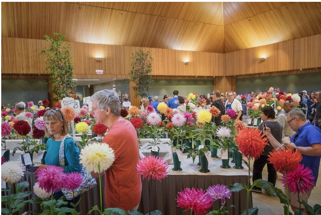
2017 ADS National Show at Chicago Botanic Garden

The success of CSDS helped inspire the formation of the Southtown Dahlia Club, a sister organization in Chicago's south suburbs. Several of their members are actively serving in leadership and volunteer roles for the event, and we deeply appreciate their contributions and support!