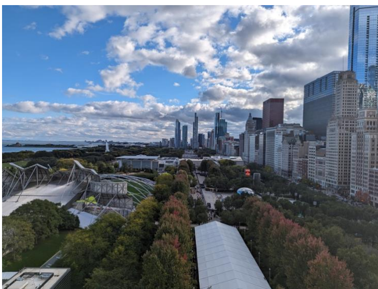
View south into Millenium Park in Chicago.

Looking to extend your stay and make it a vacation? Here are additional ideas of things to do in the area . If you're a baseball fan, the Cubs will be playing at Wrigley Field for six nights starting on Tuesday—a great opportunity to experience a game at this historic ballpark.